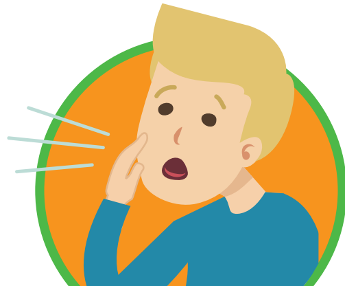
COUGH OR COLD